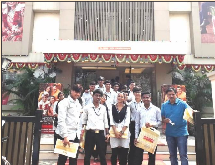
Outing of Hostellers