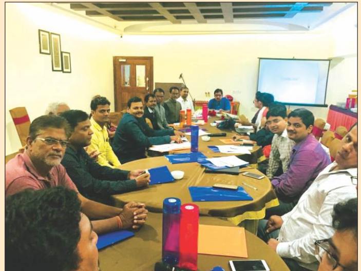
Launching of Startup Programme