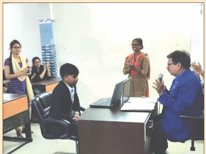
Activity Club (KBC)